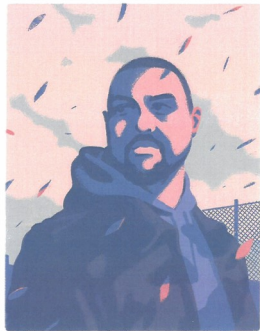
Specifically For Men

NEW LIFE MINISTRIES (50 AND UP) WILL BE HOSTING A PATRIOTIC POTLUCK TUESDAY, MAY 10TH AT 11:15AM